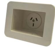
Dynamix AV-RPS01 Flush Mount Socket.